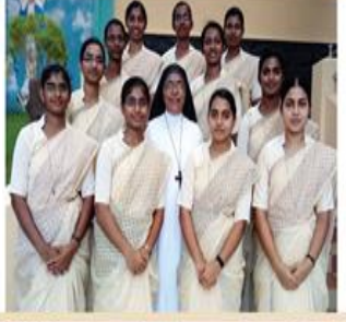
Period of Novitiate